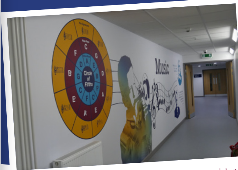
Main reception area and ground floor corridor leading to main hall