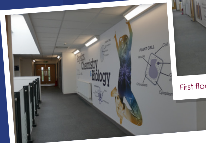
Second floor science corridor