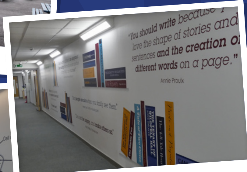
First floor corridor leading to the library